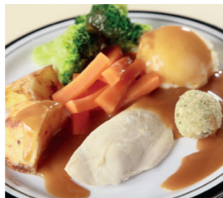
Roast Chicken Lunch served with Roast/Mashed Potatoes, Seasonal Vegetables & Gravy