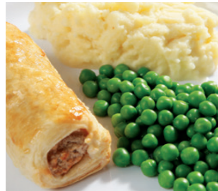
Oven Baked Sausage Roll, Mashed Potato served with Baked Beans or Seasonal Vegetables