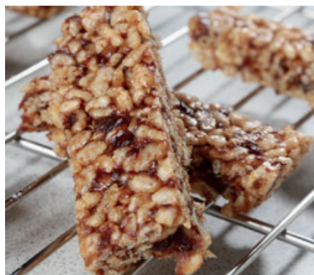
Caramel Crispy Bar