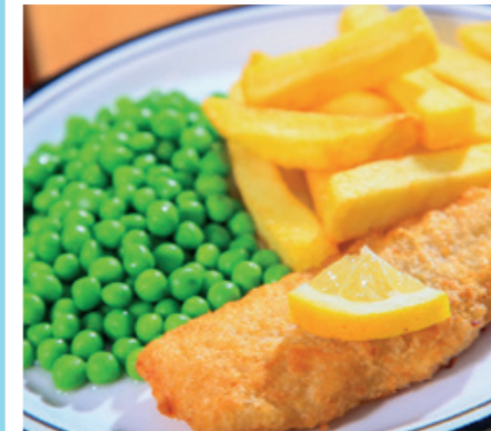
Battered Fish served with Chips, Baked Beans or Peas