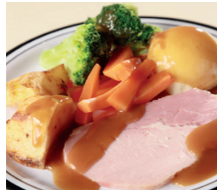
Roast Gammon Lunch served with Roast/Mashed Potatoes, Seasonal Vegetables & Gravy