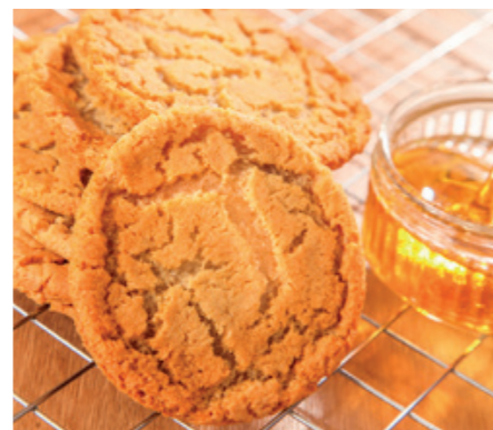
Golden Crunch Biscuit