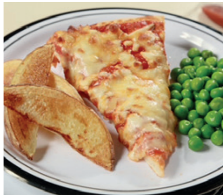
Thin & Crispy Margherita Pizza (V) served with Potato Wedges, Baked Beans, Seasonal Vegetables or Coleslaw