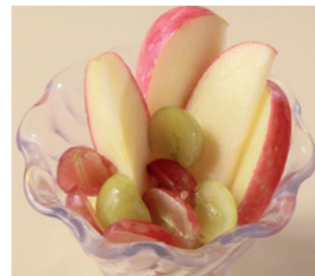
Apple & Grape Pot