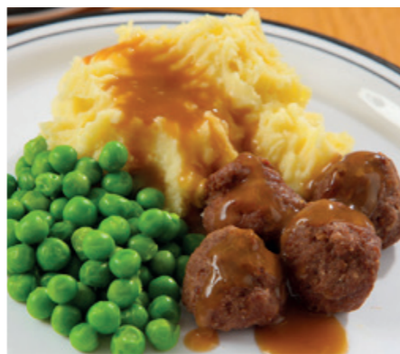
Meatballs in Gravy served with Mashed Potato & Seasonal Vegetables