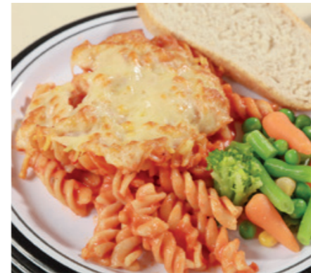
3 Cheese & Tomato Pasta (V) served with Crusty Bread & Seasonal Vegetables