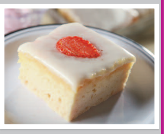
Strawberry Ice Cream Cake

AVAILABLE EVERY DAY - UNLIMITED SALAD, FRESHLY BAKED BREAD, FRUIT YOGHURT & FRESH FRUIT PLATTER. FOR ALLERGEN INFORMATION, PLEASE ASK ONE OF OUR CATERING TEAM. ALL THE ABOVE DISHES ARE SUBJECT TO AVAILABILITY.