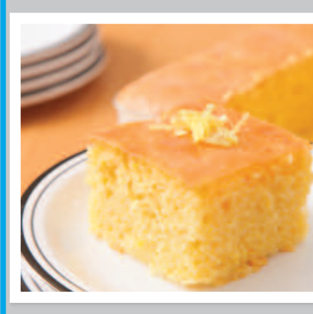
Lemon Drizzle Cake

AVAILABLE EVERY DAY - UNLIMITED SALAD, FRESHLY BAKED BREAD, FRUIT YOGHURT & FRESH FRUIT PLATTER. FOR ALLERGEN INFORMATION, PLEASE ASK ONE OF OUR CATERING TEAM. ALL THE ABOVE DISHES ARE SUBJECT TO AVAILABILITY.