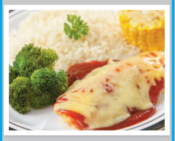
BBQ Chicken served with Savoury Rice and Seasonal Vegetables