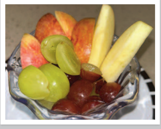
Apple & Grape Pot