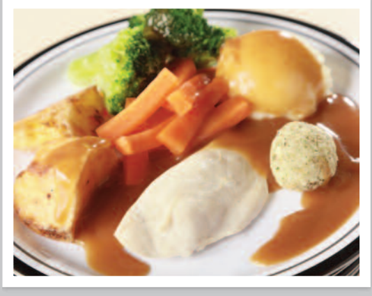
Roast Chicken served with Roast/Mashed Potatoes , Seasonal Vegetables & Gravy