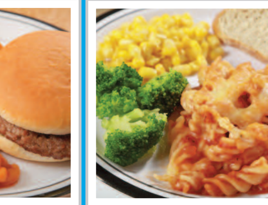
Cheese & Tomato Pasta served with Garlic & Herb Bread and Seasonal Vegetables