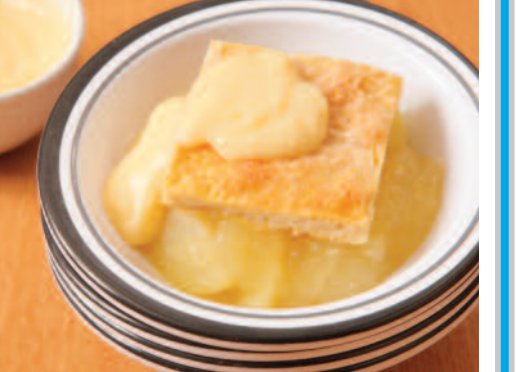
Apple Pie & Custard